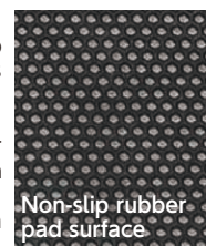
Non-slip rubber pad surface