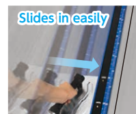
Slides in easily