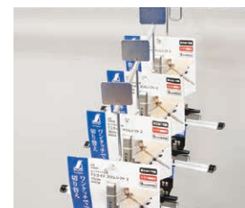
Tiers allow view of products from front to back