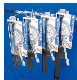
The three-dimensional display makes a great impact on the sales floor.